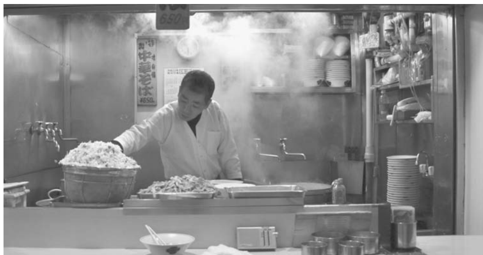
A ramen shop in Tokyo, Japan. Ramen noodles are the most popular fast food in Japan and are now sold world-wide.

These noodles are made of regular wheat (not buckwheat), steamed and served with such vegetables as Chinese cabbage, bamboo shoots, mushrooms, and carrot, with the addition of shrimp, squid, and pork. The ingredients are fried together and served with a rich sauce.